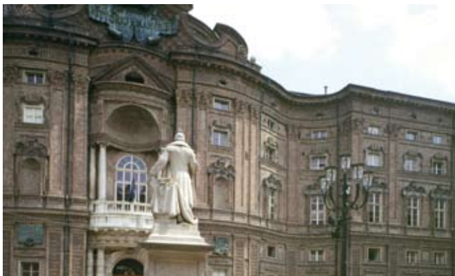
Palazzo Carignano

There will be two glorious backdrops to Experience Italy: the Reggia di Venaria Reale, a unique royal residence of environmental merit and exceptional architecture just outside Turin, and the OGR - Officine Grandi Riparazioni, a masterpiece of industrial architecture in the very heart of the city.