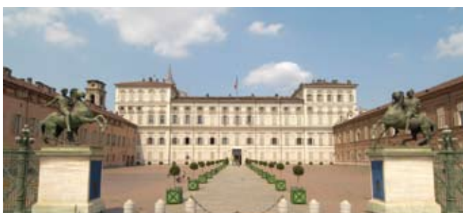
Palazzo Reale Giovanni Fontana for Turismo Torino

In the splendid Gardens of the Reggia, the Potager Royal opens in 2011: 10 hectares given over to vegetable garden and orchards containing thousands of vegetables and cereals typical to the territory. Visitors can discover them on the botanical, cultural and gastronomic tour routes, workshops for education in the senses, horticulture, cookery techniques and sampling of products from the vegetable garden together with Italian regional dishes.