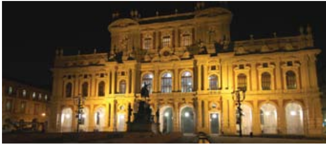
Palazzo Carlo Alberto