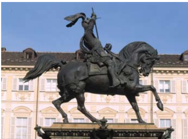
Monument to Emanuele Filiberto Claudio Penna for Turismo Torino

From 17 March to 20 November 2011 there will be 250 days of shows, themed exhibitions, conferences and debates looking at the past, dealing with the present and visualising the future of the country. Turin and Piedmont are to be the setting, becoming a vast laboratory for designing Italy of the near future.